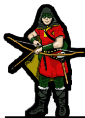
Dark Age Robin